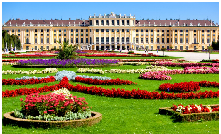
Schönbrunn Palace ~ Vienna