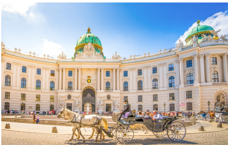
Hofburg Palace ~ Vienna

This morning enjoy a sightseeing tour of Vienna beginning with a drive around the Ringstrasse, one of the most magnificent boulevards in the world. It encloses the Inner City and such noble edifices as the Votive Church, built in 1856, the University, the City Hall and the Opera House. Continue to Schönbrunn Palace with its glorious French Park. The Palace has 1400 rooms and halls, a small zoo and a fine museum of state coaches. Your afternoon is at leisure for shopping or exploring on your own. (B)